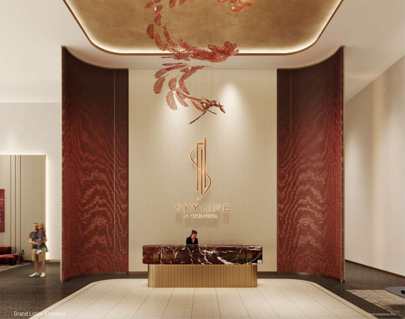
Grand Lobby Entrance