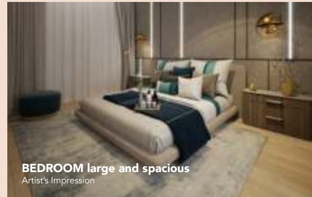
BEDROOM large and spacious Artist's Impression