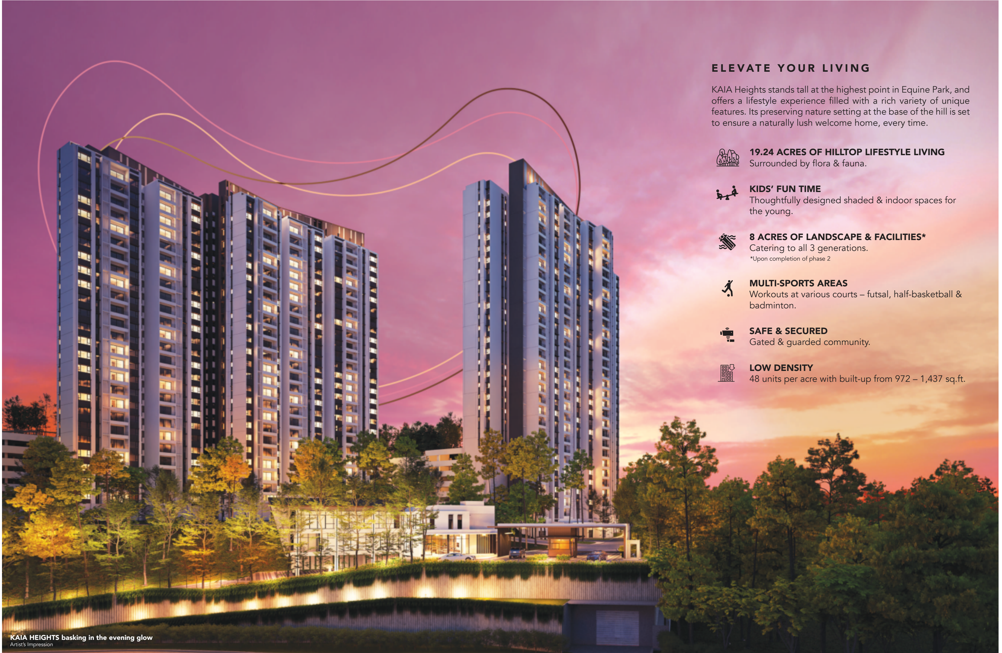
KAIA HEIGHTS basking in the evening glow Artist's Impression