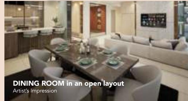
DINING ROOM in an open layout Artist's Impression

Homes at KAIA Heights are generous in space and flexible in design. Larger floor spaces allow you more comfort and afford more opportunities for you to craft your personal stylised living atmosphere.